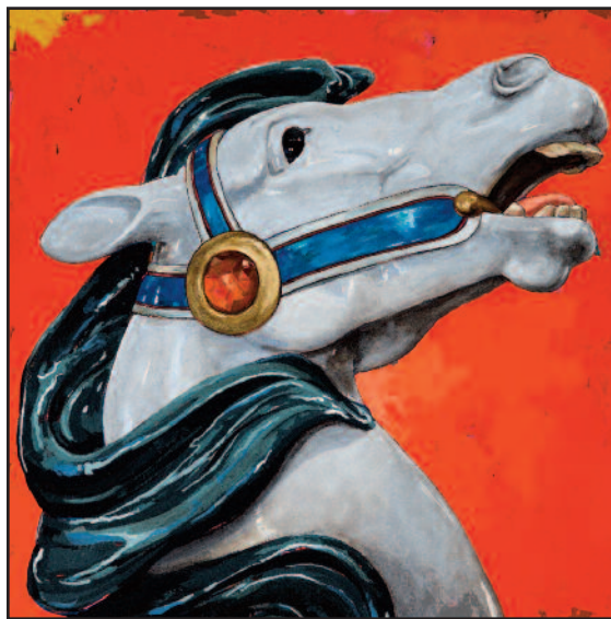
Acrylic painting of Loeff horse, Santa Cruz Beach Boardwalk.